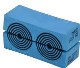
Modules GM avec Multidiameter™